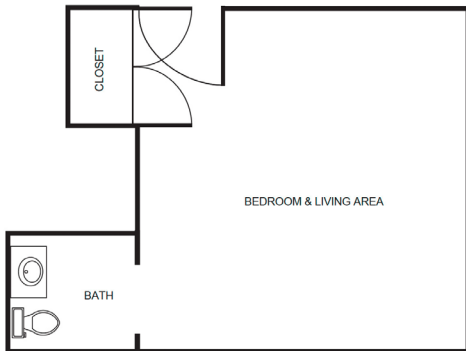
Studio starting at .....$5,775