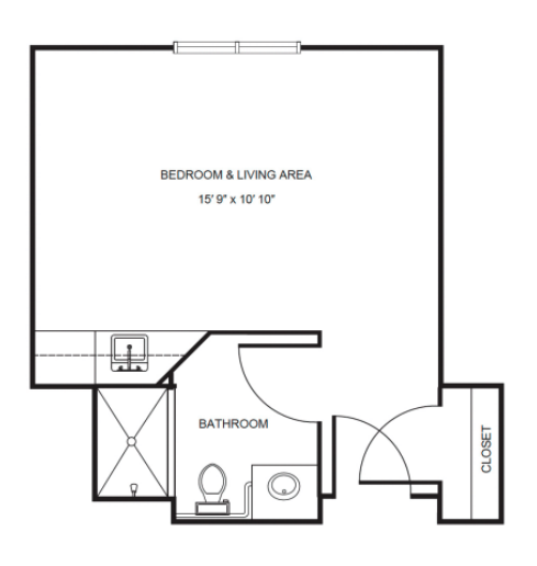
Deluxe Studio starting at .....$4,250