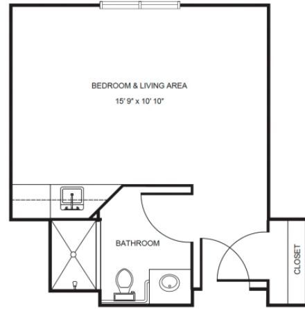
Deluxe Studio starting at .....$4,375