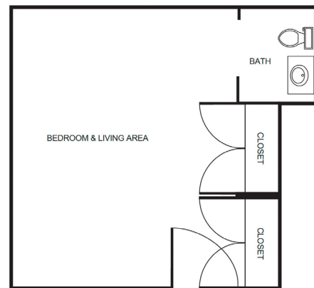
Companion starting at .....$5,125