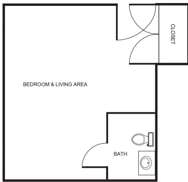
Studio starting at .....$5,500