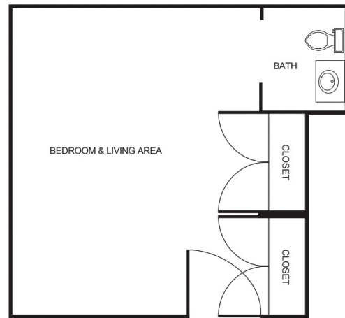
Companion starting at .....$4,200