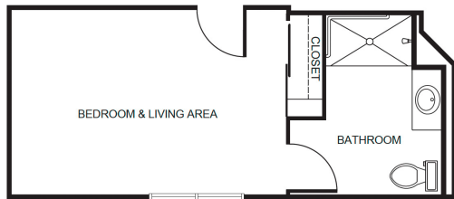
Studio starting at .....$7,200