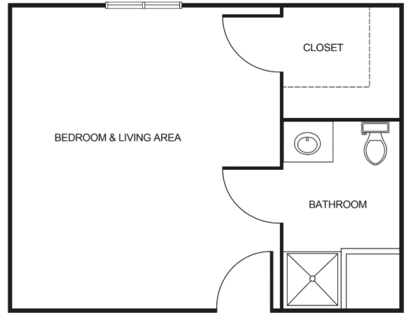
Studio Deluxe starting at .....$4,550