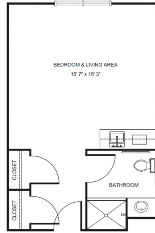
Deluxe Studio starting at .....$4,275 Deluxe Large Studio starting at .....$4,375