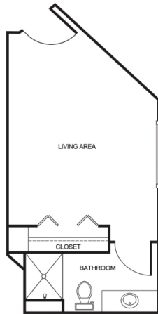
Studio starting at .....$2,925 based on size small, medium or large