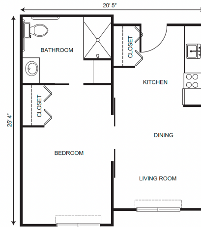
One Bedroom starting at ..... $5,475